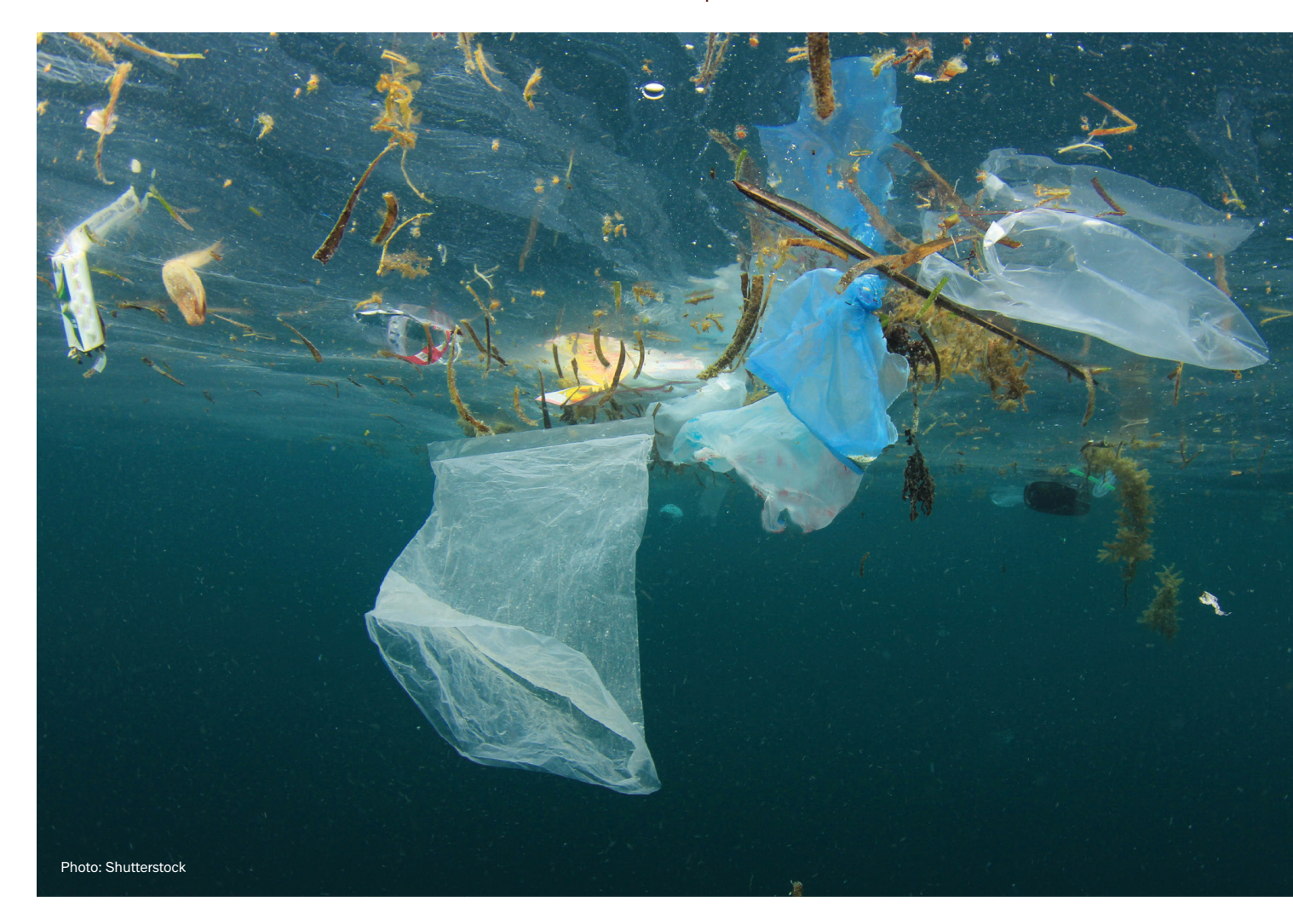
6) Encore tool, Natural Capital Finance Alliance in partnership with UNEP-WCMC

Storebrand will always seek to align its investments with scientific consensus on nature. This means that Storebrand supports the commitments outlined in the Convention on Biological Diversity and that statements and reports from the Intergovernmental Panel on Biodiversity and Ecosystem Services (IPBES) will provide the scientific basis for our subsequent investment decision making. If there is scientific uncertainty with regards to the negative effects of specific activities on nature, Storebrand will adopt the precautionary principle. Although we will assess each individual situation separately, there are certain practices