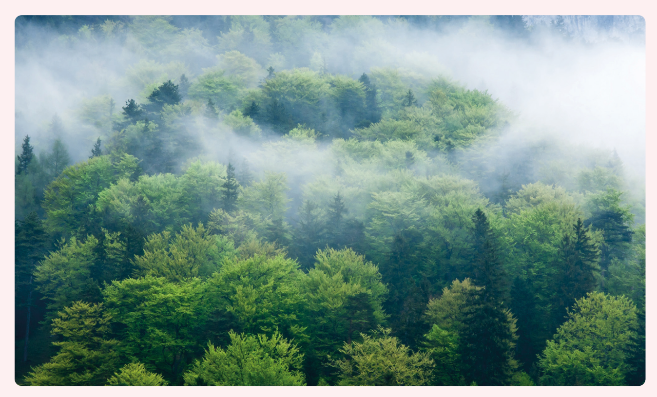
This policy is a supporting document to the Storebrand Group Sustainable Investment Policy, detailing how Storebrand can contribute to reversing nature loss. It also takes consideration of the EU taxonomy and Sustainable Finance Disclosure Regulations (SFDR) which will also be central in guiding what constitutes a positive impact on nature and will require increased transparency and reporting on biodiversity risks and impacts in our investment portfolios.

This policy is detailing key areas where we believe we can contribute. These are mainly through 1) Impact assessment and target setting 2) Engagement with relevant stakeholders, 3) Risk management: Increasing our positive and reducing our negative impact on nature and 4) Reporting: nature related Financial Disclosure.